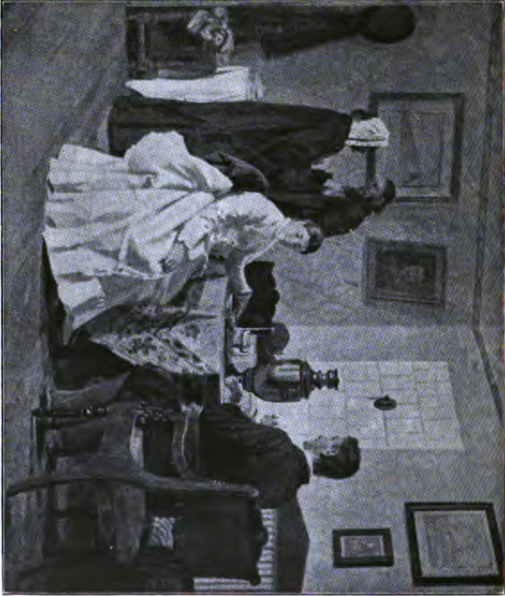
WHEN THEY CAME BACK FROM CHURCH THEY DRANK TEA IN A DEPRESSED MANNER