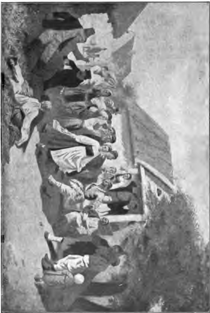
"HE DANCED UNWEARIEDLY, OBLIVIOUS OF EVERYTHING."