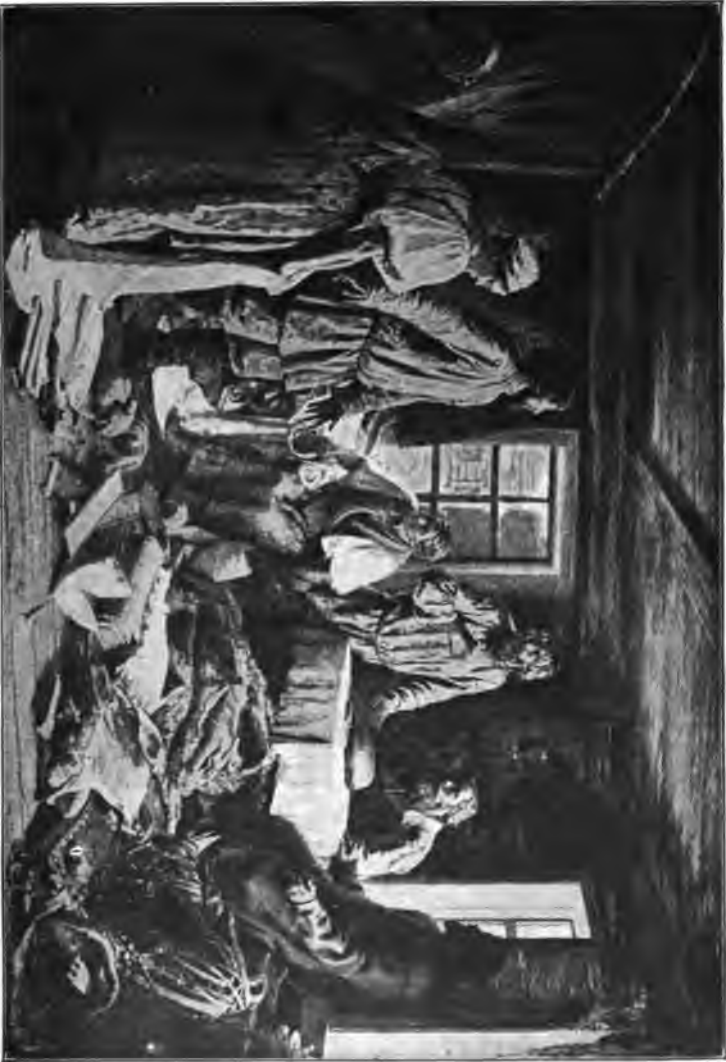
THE SHARING-OUT OF THE FAMILY GOODS